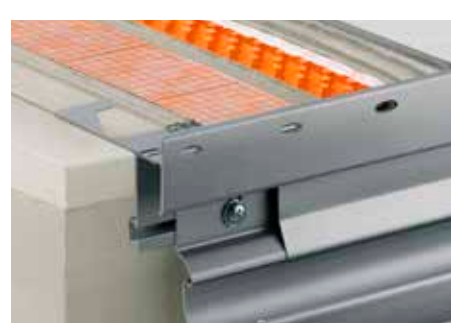
Assembly with Schlüter-DITRA-DRAIN 8 and Schlüter-BARA-RTKE 23