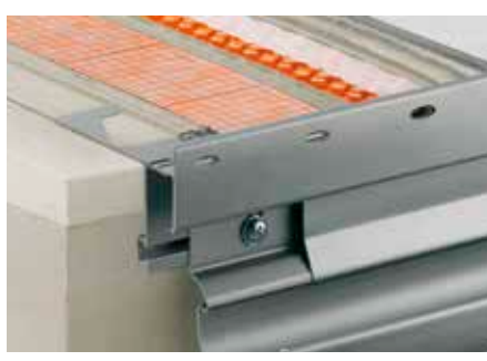
Assembly with Schlüter-DITRA-DRAIN 4 and Schlüter-BARA-RTKE

5. Once the covering is fully installed, the gutter system can be attached to the BARA profile, using the supplied screws. The elongated openings allow for setting up a slope.