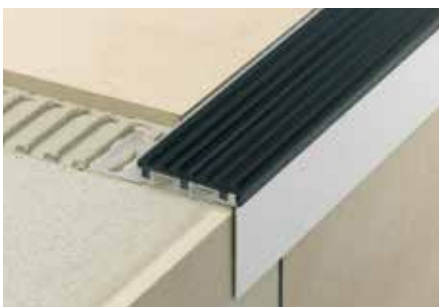
Schlüter®-TREP-B with Schlüter®-TREP-TAP