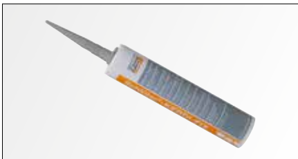
Schlüter®-KERDI-FIX is perfect for adhering and sealing abutting joints of Schlüter®-KERDI waterproofing membranes.