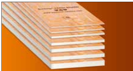
Schlüter®-KERDI-BOARD A universal substrate for the installation of tile and stone on walls. Creating the perfect substrate for bonded waterproofing assemblies.

Presented by (your construction materials specialist):