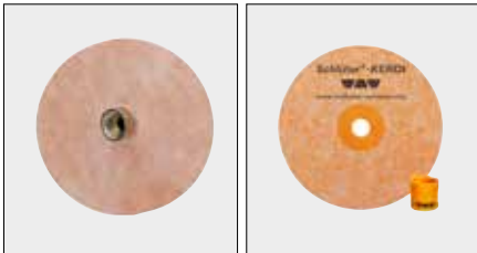
Schlüter®-KERDI-KM / -MV Pipe collars with fleece-free inner zone.