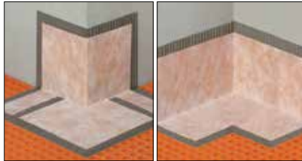
Schlüter®-KERDI-KERECK Pre-formed external and internal corners.