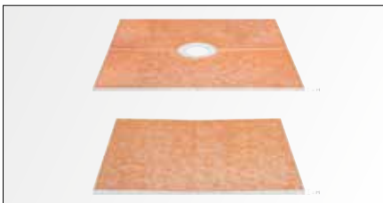
Schlüter®-KERDI-SHOWER / -SHOWER-L A modular system for the construction of floor-level showers with tile and stone. Sloped trays are available in a wide range of sizes, with accessories to integrate with point drains from the drainage Schlüter-KERDI-DRAIN range or the linear drain range Schlüter-KERDI-LINE.