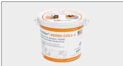
Schlüter®-KERDI-COLL-L is a 2 component sealant adhesive based on a solvent free acrylate dispersion and a reactive cementitious powder. It is suitable for adhering and sealing overlaps and joints of Schlüter-KERDI membranes.