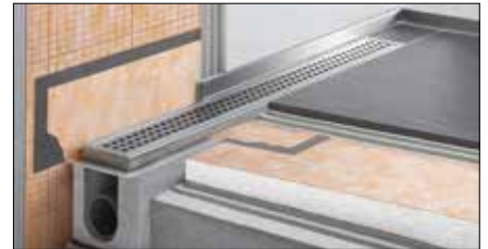
Schlüter®-KERDI-LINE Complete set for linear floor level showers