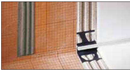
Schlüter®-KERDI-200 / -KERDI-DS For waterproofing in conjunction with tiled surfaces on walls and floors.