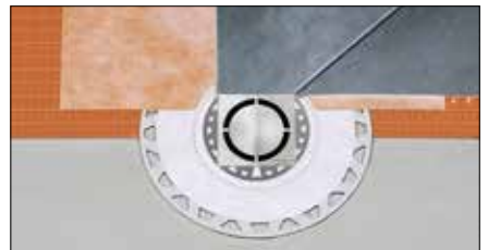
Schlüter®-KERDI-DRAIN Floor drain system for a guaranteed connection to Schlüter-KERDI or other bonded waterproofing assemblies.