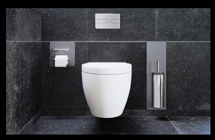
Toilet paper holder and Toilet brush set

The KEUCO accessories of the PLAN range are a popular choice. The award-winning timeless design of the PLAN range with its clear lines can be found in stylish bathrooms all around the world - in private residences, hotels and public buildings. Due to its sophisticated aesthetic, high-level functionality and outstanding quality, the PLAN range has become a modern classic that is a discerning choice of architects, designers and developers.