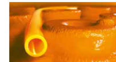
Schlüter®-BEKOTEC-THERM The ceramic thermal comfort floor