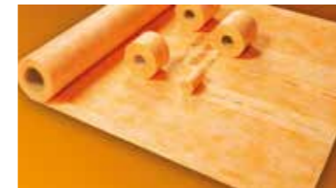
Schlüter®-KERDI Secure water-proofing membrane