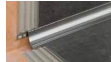
Schlüter®-DILEX Profile system for permanently maintenance free movement joints and edge joints

Would you like to know more about Schlüter products and system solutions for tile installation? The following brochures are available from our distribution partners. For more information, please visit our website at www.schluter.co.uk .