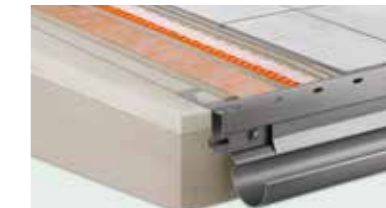
Schlüter®-Balcony Systems Complete solutions for new construction and renovation of balconies and terraces