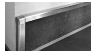
Schlüter®-RONDEC, -JOLLY and -QUADEC Profile systems for the design and edge protection of wall corners