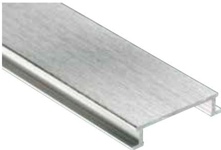
Schlüter®-DESIGNLINE-AGBE brushed anodised(-ACGB)