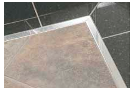
Schlüter®-DESIGNLINE-E in floor installation