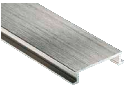
Schlüter®-DESIGNLINE-AGBE brushed anodised (-ATGB)