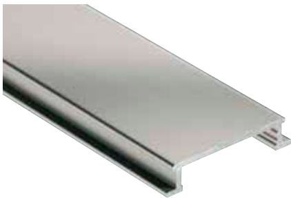
Schlüter®-DESIGNLINE-AME satin anodised (-AT)