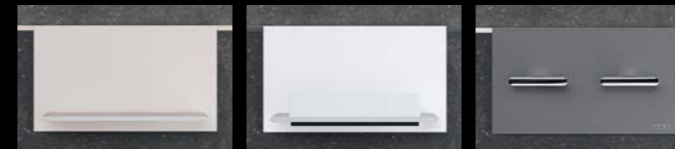
Shelf Shelf with glass wiper Dual towel hook