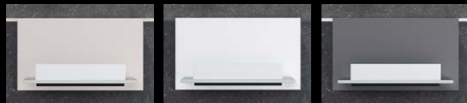
natural cream matte brilliant white dark anthracite

Schlüter-ARCLINE-BAK are designer bathroom accessories made by KEUCO, which are pre-mounted on 6 mm coloured ESG safety glass. The glass panels have a rear bracket that easily clicks into Schlüter-ARCLINE profiles for adjustable positioning. The accessories from the KEUCO design series EDITION 400, EDITION 11 and PLAN are available in a variety of colour palettes and cover a broad range of styles. The bathroom accessories can only be installed in conjunction with ARCLINE profiles.