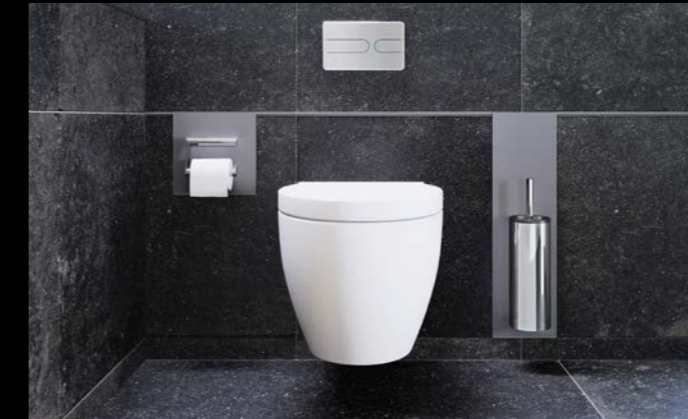
Toilet paper holder and Toilet brush set

The KEUCO accessories of the PLAN range are a popular choice. The award-winning timeless design of the PLAN range with its clear lines can be found in stylish bathrooms all around the world – in private residences, hotels and public buildings. Due to its sophisticated aesthetic, high-level functionality and outstanding quality, the PLAN range has become a modern classic that is a discerning choice of architects, designers and developers.