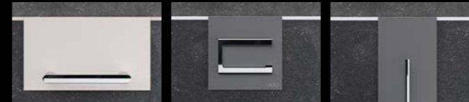
Towel ring Toilet paper holder