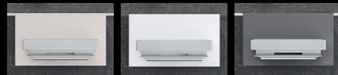
natural cream matte brilliant white dark anthracite

The design of EDITION 11 accessories stands out for visual lightness and elegance.. Their distinctive, yet understated design lends every-day bathroom items a sense of style. Accessories with chrome-plated surfaces draw attention with their flawless quality: slim and striking in design, extraordinary and surprising in function, brilliant and outstanding in surface shine. Perfect functionality down to the last detail: the shower basket with integrated glass wiper features a high-quality aluminium insert that stands out for its sturdiness and easy care.