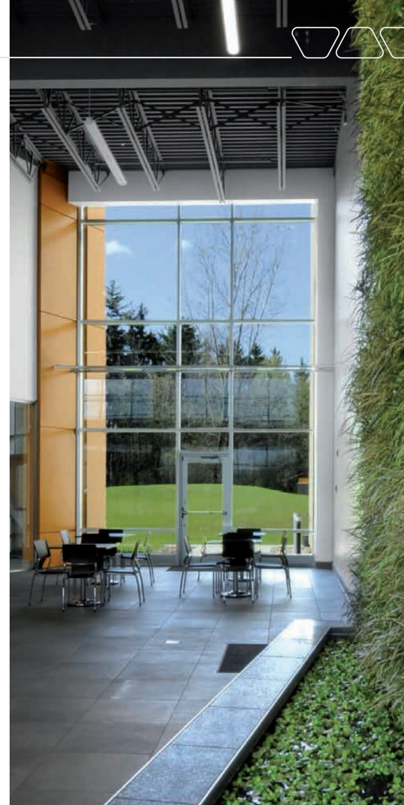
Gold level LEED certificate: Schlüter-Systems branch office in Montreal, Canada.

Additionally, our company headquarters in Iserlohn is heated with concrete core activation and thermal comfort floors that use geothermal energy.