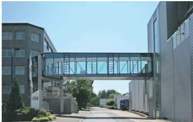
Model project for using renewable energy sources: Schlüter-Systems company headquarters in Iserlohn.

Our products not only stand out for their extreme durability, but also are reusable in most cases at the end of their lifecycle, for example by recycling their metal content.