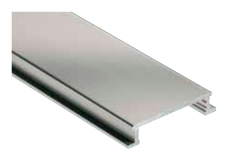
Schlüter®-DESIGNLINE-AME satin anodised (-AT)