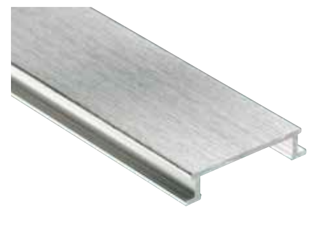
Schlüter®-DESIGNLINE-AGBE brushed anodised(-ACGB)