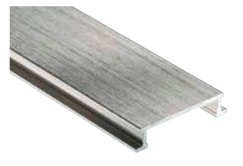
Schlüter®-DESIGNLINE-AGBE brushed anodised (-ATGB)