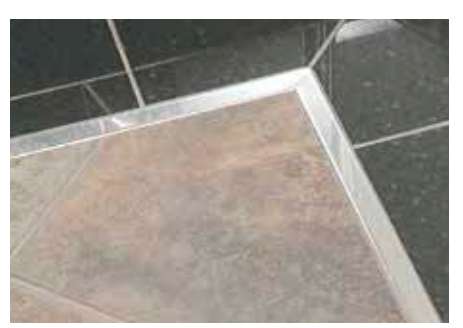
Schlüter®-DESIGNLINE-E in floor installation

Follow all safety instructions and requirements of the cutting tool manufacturer, including the use of safety goggles, ear protection and gloves. Regardless of the cutting tool to be employed, all burrs at the profile ends must be removed with a file or a comparable tool prior to installation.