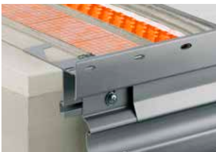
Assembly with Schlüter-DITRA-DRAIN 8 and Schlüter-BARA-RTKE 23