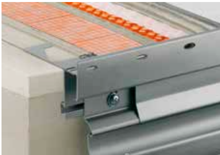
Assembly with Schlüter-DITRA-DRAIN 4 and Schlüter-BARA-RTKE