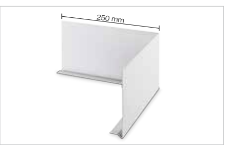
external corner: Schlüter®-BARA-FAP/E 90°

Note: We recommend the joint cover Schlüter®-BARA-STU as a connector.